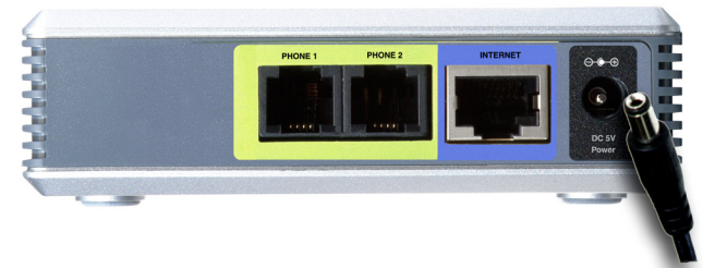
Figure 3-4: Connect the Power Adapter