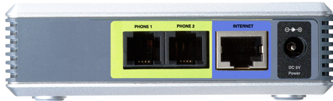
Figure 2-1: Back Panel

The Phone Adapter's ports are located on the back panel.