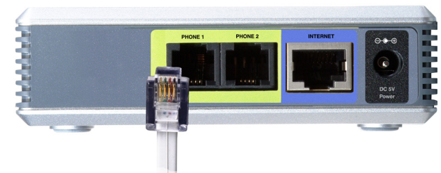
Figure 3-2: Connect the RJ-11 Telephone Cable

IMPORTANT: Do not connect either of the Phone ports to a telephone wall jack. Make sure you only connect a telephone or fax machine to either of the Phone ports. Otherwise, the Phone Adapter or the telephone wiring in your home or office may be damaged.