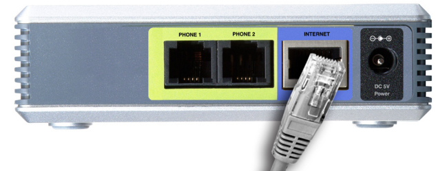
Figure 3-3: Connect the Ethernet Network Cable

The installation of the Phone Adapter is complete. Now you can pick up your phone and make calls.