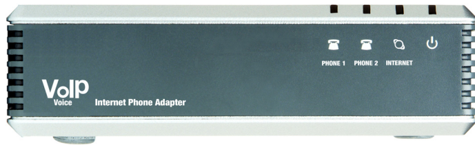
Figure 2-2: Front Panel

The Phone Adapter's LEDs, which inform you about network activities, are located on the front panel.